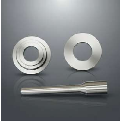
STELLITE HOMOGENIZATION UNIT