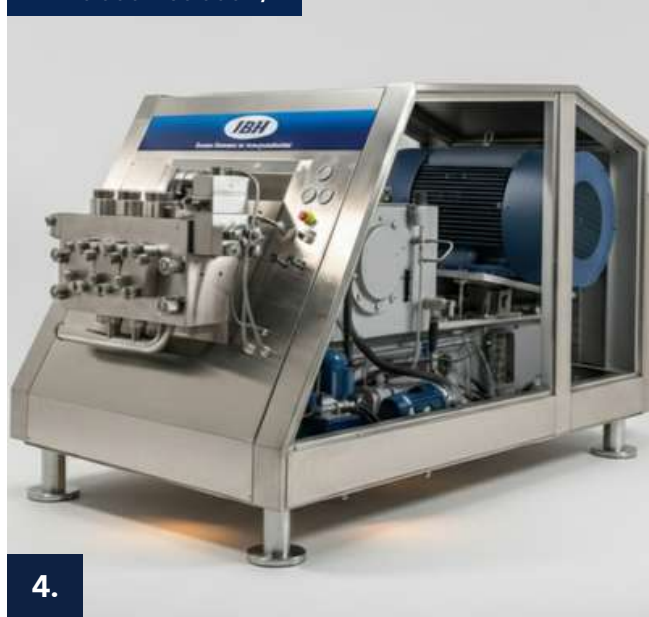
APL-10.000 A 30.000 L/H