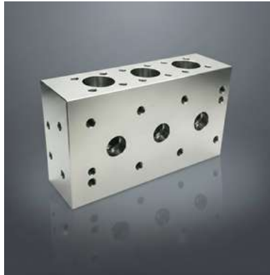
COMPLETE VALVE BLOCK