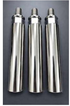
HEXAGONAL PISTONS IN CHROME OR CARBIDE