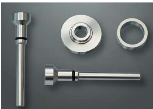
SINTERED HARD METAL HOMOGENIZATION ASSEMBLY