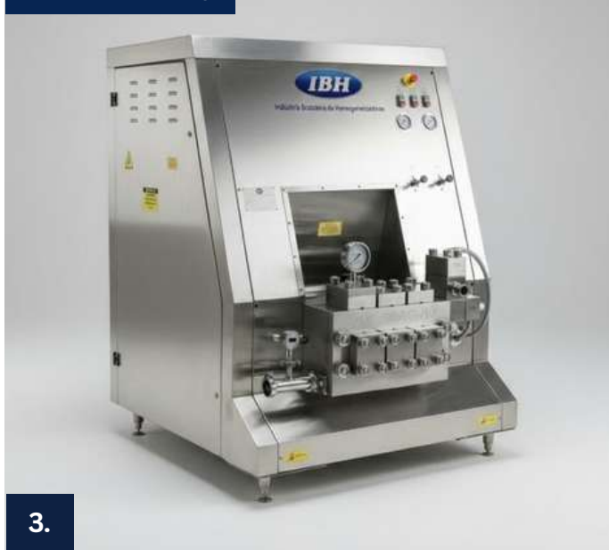
APL-4.000 A 8.000 L/H