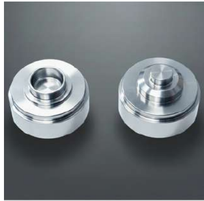
MUSHROOM AND POPPET TYPE VALVES AND SEATS