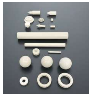
SET OF CERAMIC PIECES