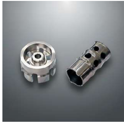
SPACERS AND BUSHINGS FOR GASKET ADJUSTMENTS