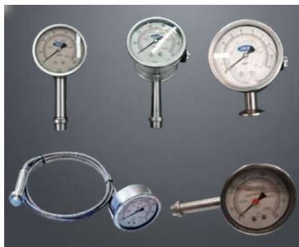
PRESSURE GAUGES FOR HOMOGENIZERS AND HIGH-PRESSURE PUMPS.