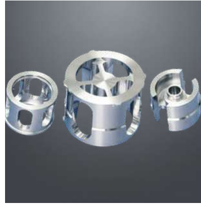
SUCTION AND DISCHARGE VALVE CAGES