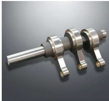
CRANKSHAFT AND CONNECTING RODS