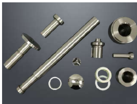
SET OF PARTS FOR HOMOGENIZERS IN HARD AND STELLITE MATERIAL.