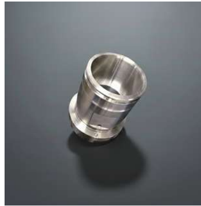
BUSHINGS AND SLEEVES FOR PUMPING PISTONS