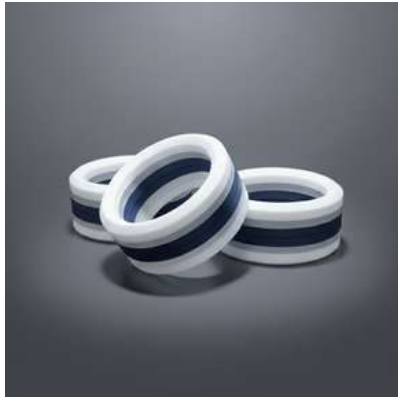
GASKETS MANUFACTURED IN IBH.