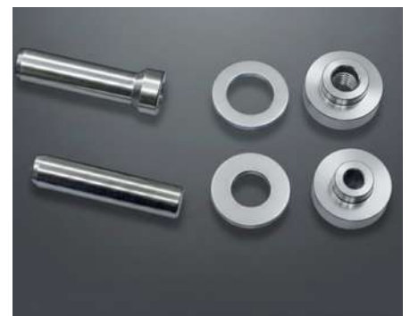
VALVE, SEAT AND IMPACT RING ASSEMBLY