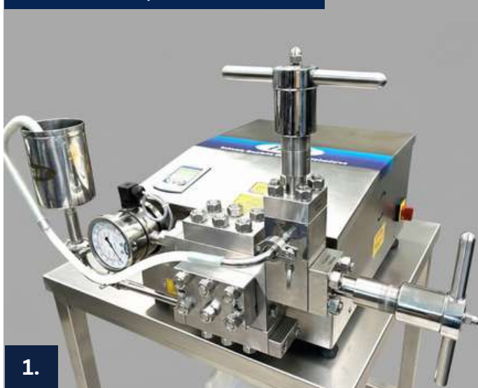
APLAB 10 TO 30 L/H - FOR LABORATORY

With advanced technology and high performance, homogenizers are indispensable in applications requiring particle reduction, emulsification, and standardization, meeting the most stringent industrial demands.