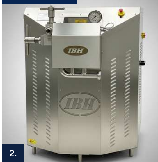
APL-100 A 3000 L/H