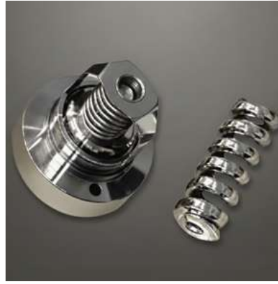
PRESSURE ADJUSTMENT SPRING